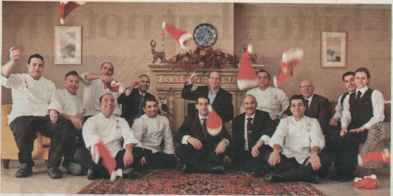
Management and staff of de Mondion restaurant celebrate after having won the top award for the third time.