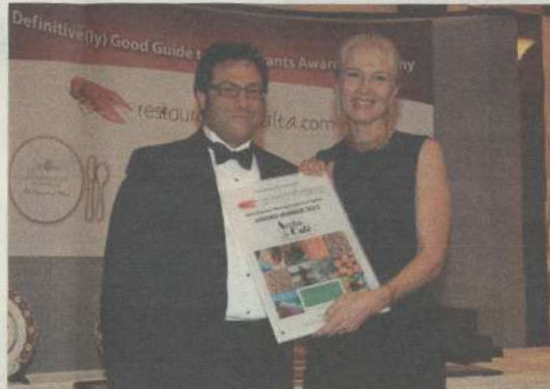
The award presented for best restaurant offering vegetarian options (sponsored by Good Earth Ltd) - Angka Cafe

The restaurants that received restaurant awards based on food, service, ambience and overall ratings (in order from top rated) were: de Mondion, Tarragon, Ta' Frenc,