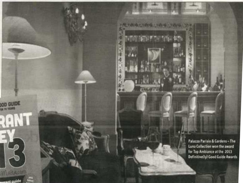
Palazzo Parisio & Gardens - The Luna Collection won the award for Top Ambiance at the 2013 Definitive(ly) Good Guide Awards