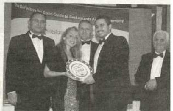
An Award for Palazzo Proca