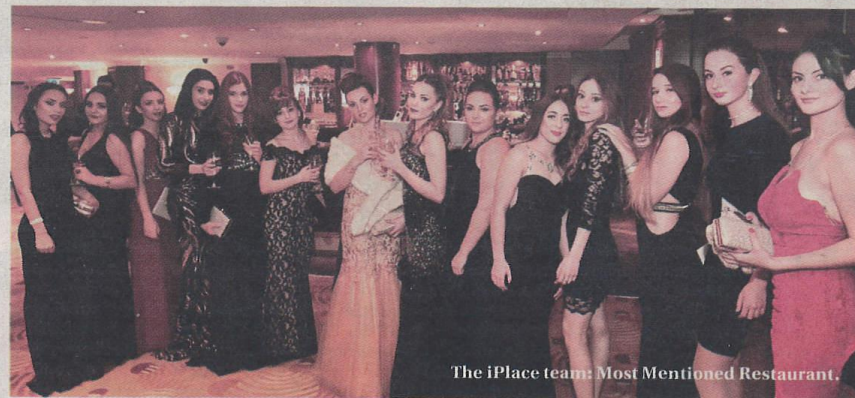
The iPlace team: Most Mentioned Restaurant.

This year sees 27 new restaurants in the The Definitive(ly) Good Guide to Restaurants in Malta