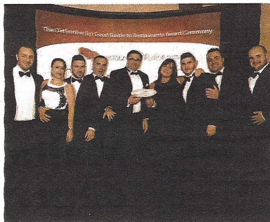
Best Restaurant - La Vela