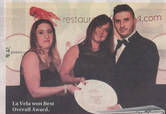
La Vela won Best Overall Award.

Additional awards were made to: Best Food – Ristorante La Vela; Best Service – Ristorante La Vela; Best