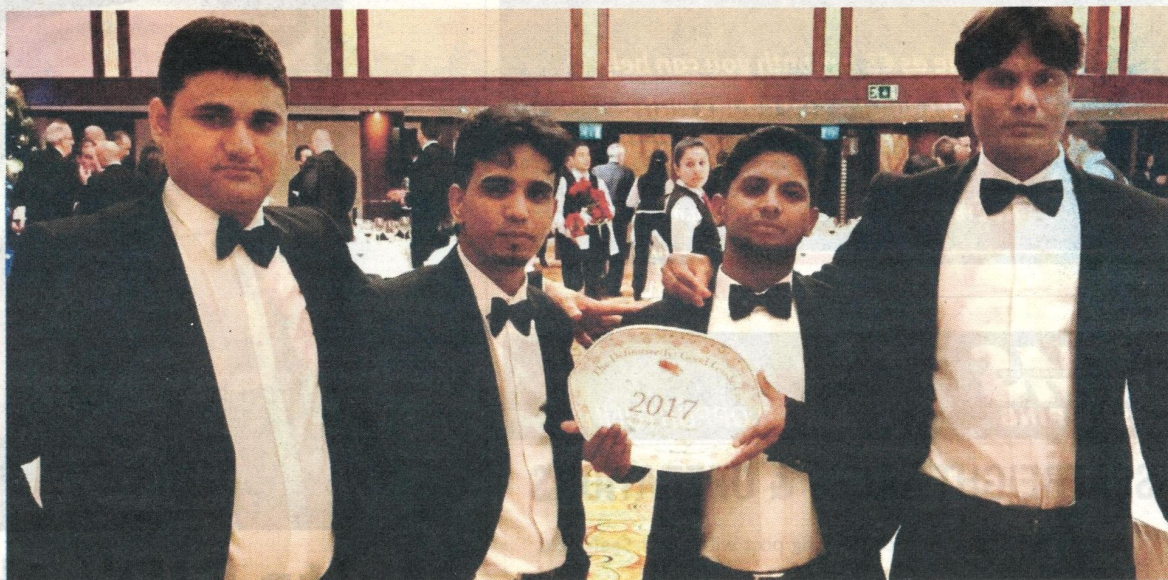
Suruchi restaurant was awarded the 17th best highly rated restaurant in Malta and Gozo in the Definitive(ly) Good Guide to Restaurants Award annual ceremony. Another prestigious achievement was a second within all restaurants on the 2017 guide.

For more information visit Suruchi's online delivery and takeaway section.