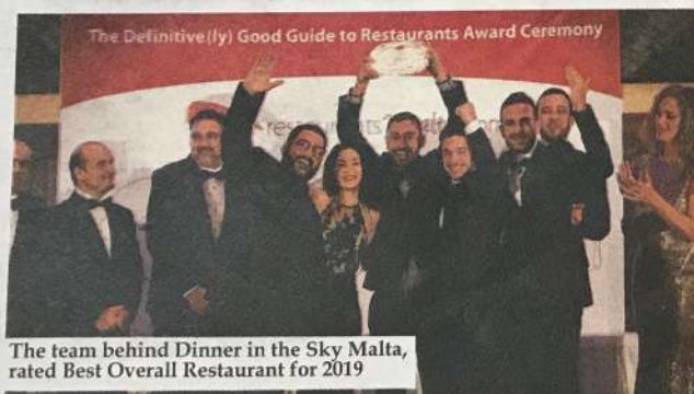
The team behind Dinner in the Sky Malta, rated Best Overall Restaurant for 2019

The Best Maltese Wine List (sponsored by The Parliamentary Secretariat for Agriculture, Fisheries and Animal Rights) – Ristorante La Vela